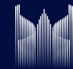
THE DUBAI FOUNTAIN

The spectacular neighbourhood of Arts and Culture